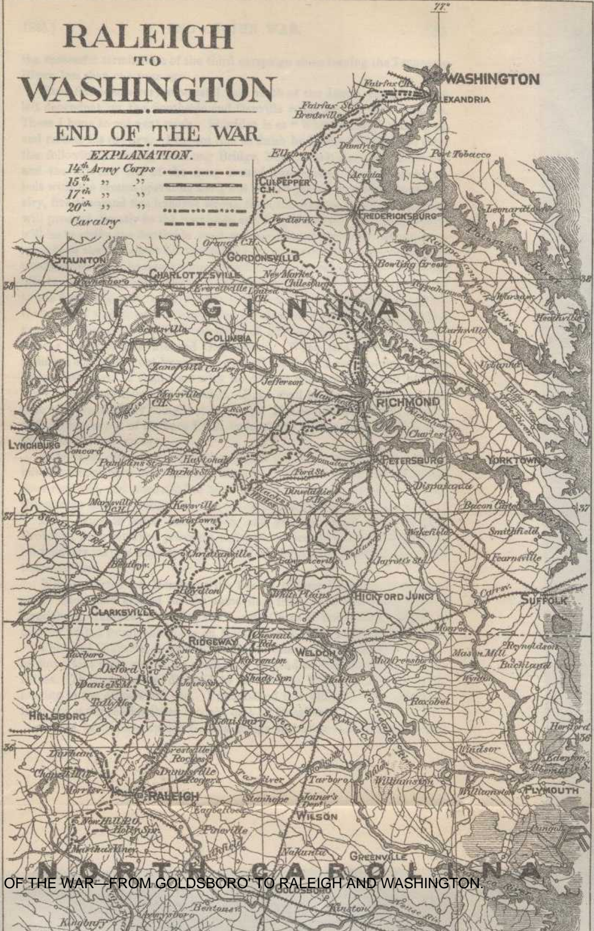
END OF THE WAR—FROM GOLDSBORO TO RALEIGH AND WASHINGTON.