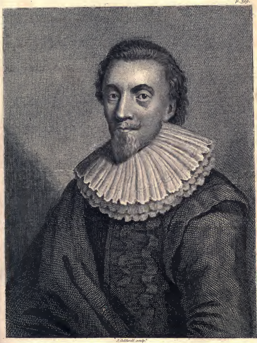
GEORGE CALVERT, THE FIRST LORD BALTIMORE.

From the Original Picture at Gorhambury.