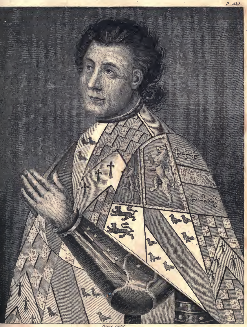
JOHN TALBOT, EARL OF SHREWSBURY.

From the Original Picture at Castle Ashby.