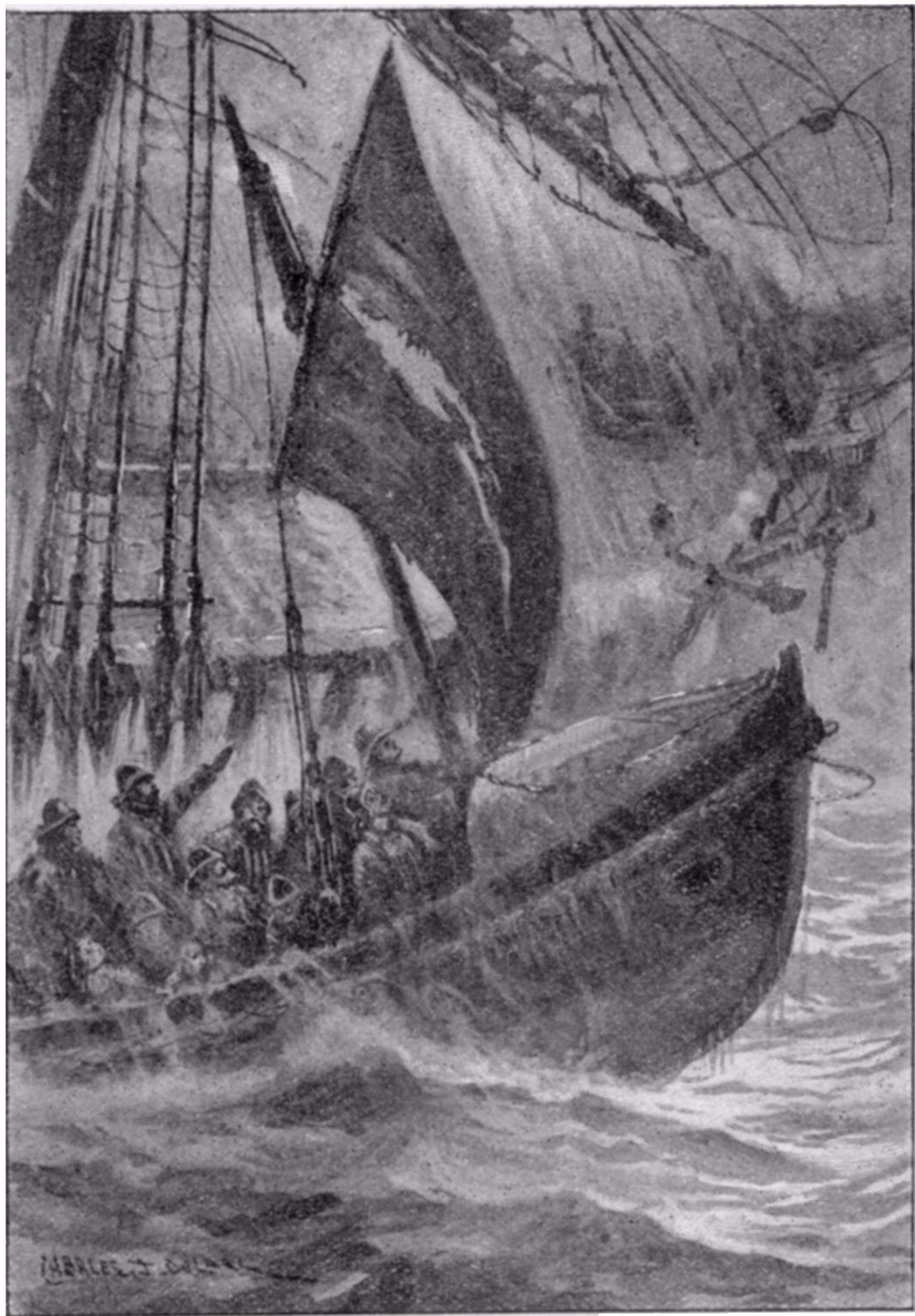
SHE REACHED THE VESSEL UNDER SAIL.