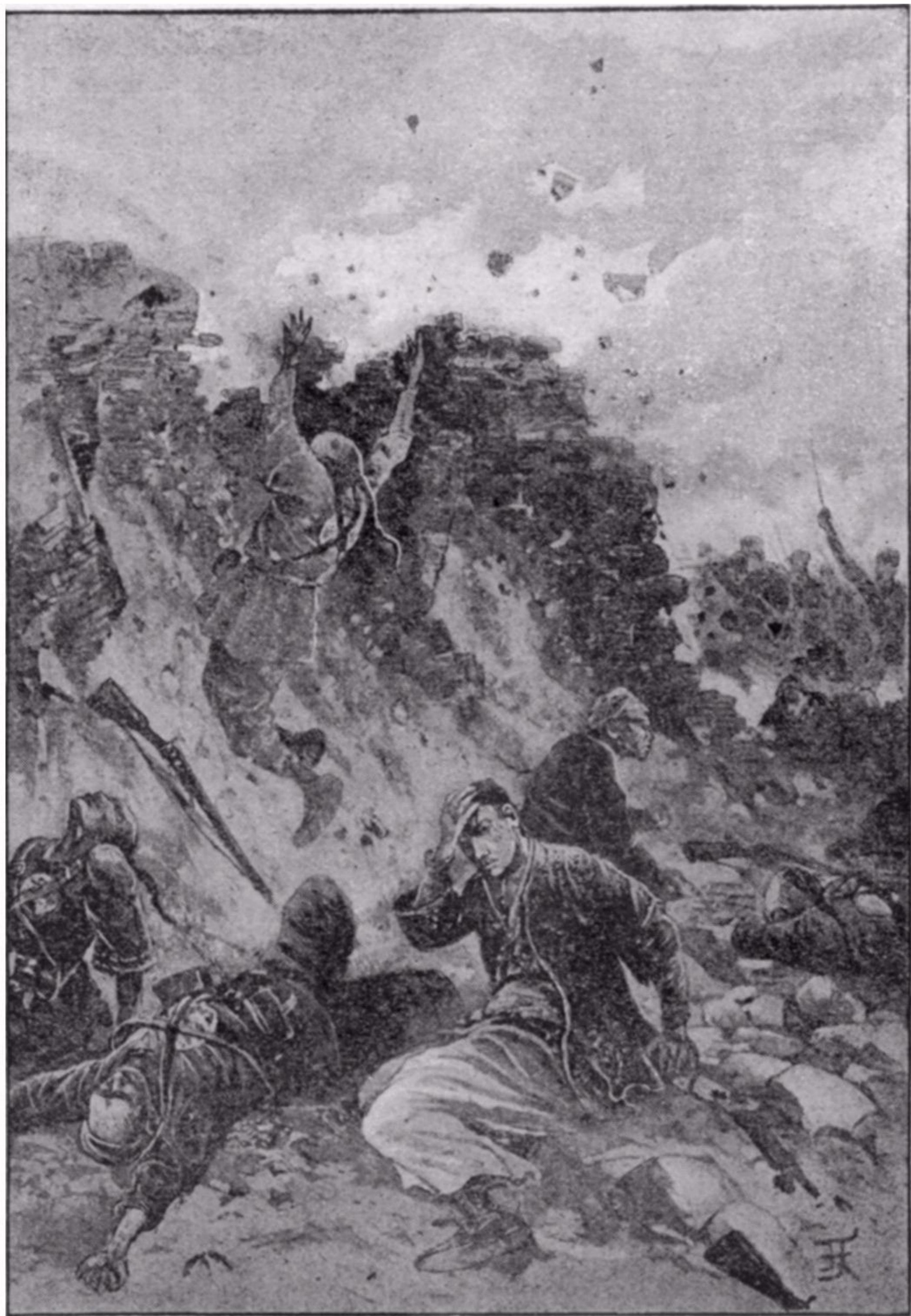
THE JAPANESE RACED WITH THE BRITISH FOR THE WEST GATE.